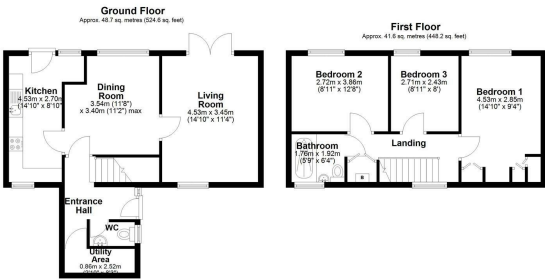
Total area: approx. 90.4 sq. metres (972.8 sq. feet)